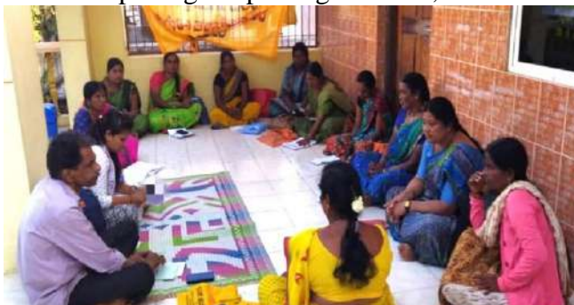
PLF collective Meeting at Chitradurga

After completing the paralegal course, in Uttara Kannada, Dharwad, Bellary, and Bagalkot districts