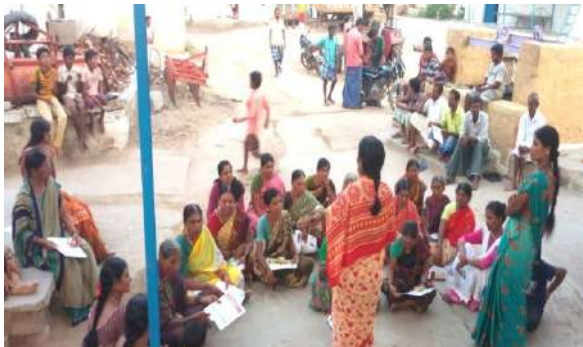
Vedachalamma Genakehalu Village, GRP at Bellary

Immediately after each phase of the paralegal program the trained PLFs organised grassroots awareness programs to the beneficiaries from their districts. Program wise 222 grassroots awareness programs on gender, 154 GRP on women laws and 73 GRP on handling issues were conducted during the year. In the follow-up districts of Koppala, Gadag and Chitrdurga 61 grassroots programs were conducted. The direct reach is about 8664 grassroots women. The breakup of the figure is about 5533 persons on gender in four current project districts