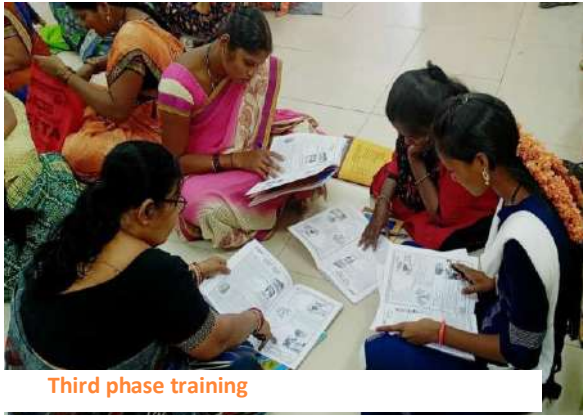
Third phase training

About 64 persons have completed gender and 53 (51 Women and 2 men) persons have successfully completed second phase of the training. Third phase of Paralegal Facilitators program on Handling Women's issues was conducted at Uttara Kannada, Dharwad and Bellary districts. About 73 PLFs (71 women 2 Men) have participated and completed the course. All together 119 persons have become Paralegal facilitators from the four districts.