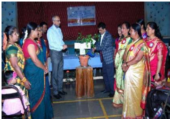
Convention at Dharwad on March 7 th , 2022

The grassroots participants shared the changes in their behaviour after the programs on gender and preparedness to take action after learning the laws on Domestic Violence, POCSO and Child Marriage. Further, participants have shared the key aspects learnt with their neighbours and distributed handbills and wall hangings with them. Vice Chancellor-Karnataka State Law University-Hubli, Hubli Taluk Session Court Judge, President of Honnavar Town Panchayat attended these Conventions.