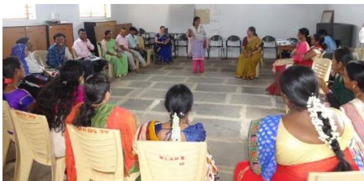
Training at Koppal

The facilitators were trained about how to file a complaint, and how to discuss the matter with lawyers and police, also they learnt how does the legal system works. They discussed with experts on various aspects related to Alternative Dispute Resolution Systems such as Nari Adalat, Arbitration and Right to Information.